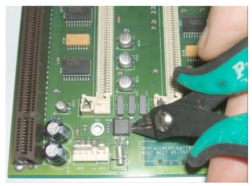
Cut the legs of the clock chip, as shown. (Depending on your computer, the chip may be in a different position on your motherboard, but the legs are the same.)

Replace the drive tray and backplane assembly, and then plug the CJE replacement clock module into a spare slot on the backplane. Replace the case on your computer, ready to switch it on. Start the computer whilst holding down the DELETE key, to reset the CMOS settings. Once the computer has reached the desktop, you will need to set the date and time to the correct values, in the normal way, along with any other custom settings you may have had.